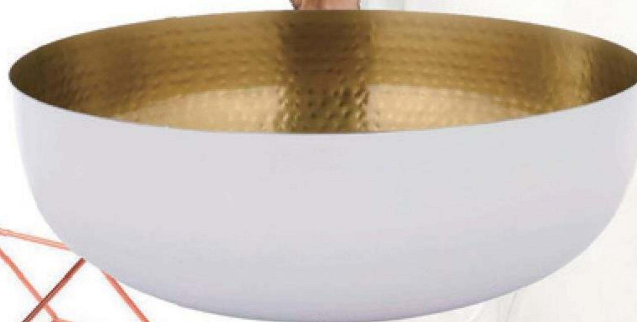
Gold/White Hammered Bowl: R199.95, Boardmans