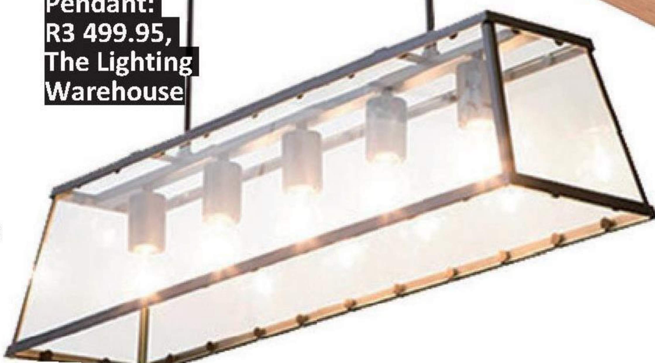
Parkview Pendant: R3 499.95, The Lighting Warehouse